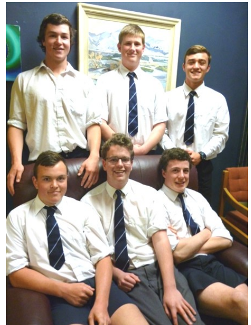
2017 Thomas House Prefects