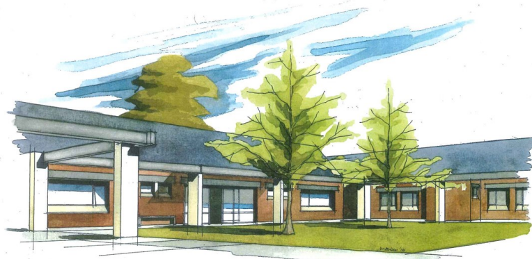
TBHS HOSTEL DEVELOPMENT CONCEPT DESIGN STAGE VIEW ACROSS COURTYARD