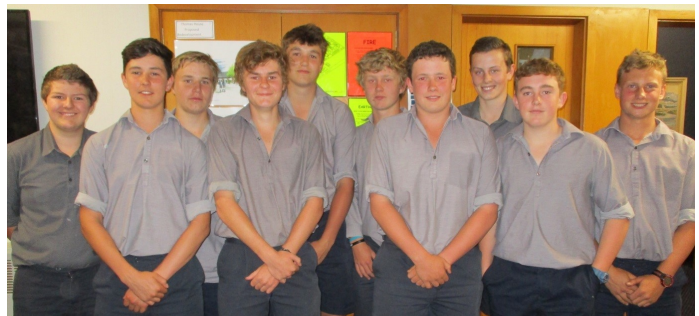
2018 Thomas House Junior Prefects